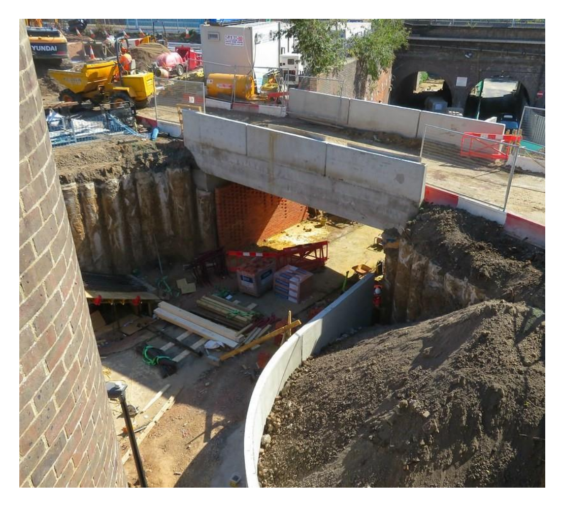
Figure 2: Partial completion of the bridge showing contiguous piles